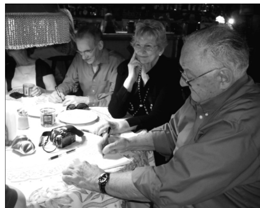
RIGHT: Shh. Writers at work.