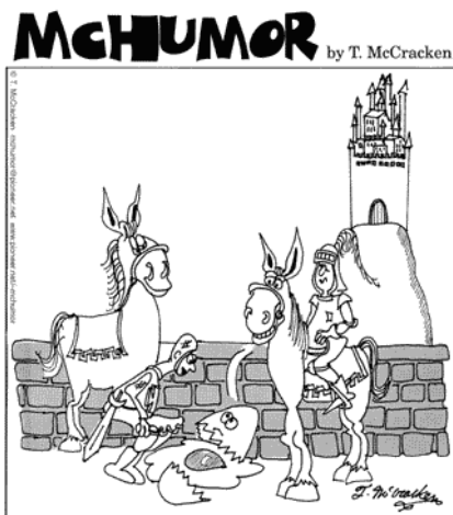
"I guess this is what's known as poetry in motion."

All performances will be held at Capers Café & Bakery, 109 North Santa Fe in Salina beginning at 7:30 p.m. Capers will offer a buffet available from 5 to 7 p.m. but food and beverage service will be suspended during the events. Parking is available nearby.